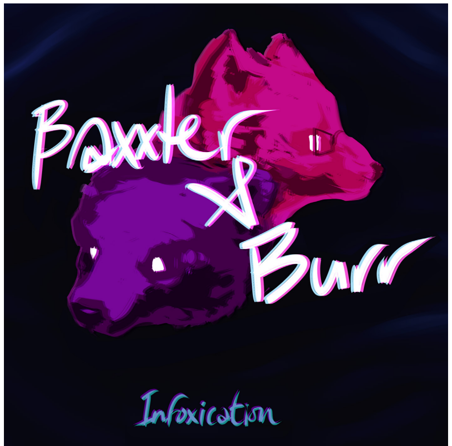
Artwork by Sarrukh

Burr Koda also did the sound design for NordicFuzzCon's animated Atlantis: The Lost Paradise promotional video. This includes all the music, sound effects, and voices (with the exception of the GPS, which was voiced by Shay). The 'Cheese Party' song can actually be heard in the background at certain places. This is because the song was originally intended to be featured more heavily in the video, but the script took a turn which did not allow for this and it was reduced to an easter egg.