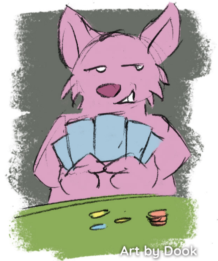
Art by Dook

The entry fee is 200 sek to be paid at the ticket booth, but if you forget to get a ticket, my sources indicate a possibility to pay at the door and enter late if you're lucky. And you wouldn't be playing poker if you weren't lucky!